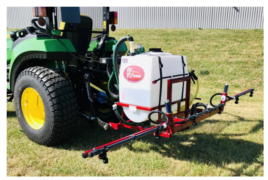
120L x 3M version with optional hand lance kit